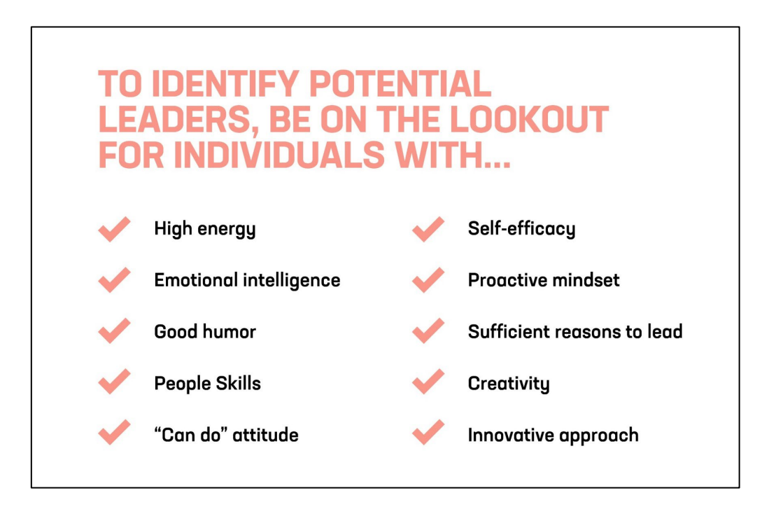
Figure 3. Identifying potential leaders

as "organizational spark plugs," those with "high energy, emotional intelligence, good humor, people skills, and a can-do attitude" (p. 88). Lubans further explains that spark plugs (aka lateral leaders) are particularly valuable for prompting change, as they are "action oriented, they learn from mistakes, adjust, ... do what common sense urges them to do, swerving past what tradition maintains and cutting through to the essentials" (2009, p. 89). Building off Lubans' work, Bugg (2016), further explains that lateral leaders "act on good ideas, initiate, need little encouragement, follow through, and collaborate (p. 493). In addition, lateral leaders are often individuals who demonstrate a high degree of self-efficacy (belief that they "can" produce given levels of attainment), have sufficient "reasons" to lead, become "energized" by being proactive, and are focused on creativity and innovation (Bandura, 1997; Chiu et al., 2021; Parker et al., 2010; Sloane & Sloane, 2017).