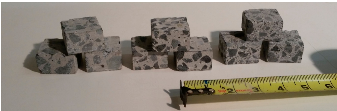
Figure 1. Concrete test specimens utilized for heat capacity and thermal conductivity testing: NWC (left), LWC (center), ALC (right).

Thermal conductivity and heat capacity tests were performed using the Fox50 Heat Flow Meter Instrument by TA Instruments (New Castle, DE, USA) in accordance to ASTM C518, "Standard Test Method for Steady-State Thermal Transmission Properties by Means of the Heat Flow Meter Apparatus" [38]. Three specimens were tested for each mixture, and specimens were prepared from a 101.6 mm (4 in.) diameter by 203.2 mm (8 in.) long cylinder. Three representative rectangular prisms approximately 38.1 mm by 38.1 mm by 25.4 mm thick (1.5 in. by 1.5 in. by 1 in.) were sawcut from the cylinder 7 days before the test date. Care was taken during sawcutting to ensure that each of the three specimens did not contain entrapped air voids and represented the mixture composition (aggregates were well distributed within the paste). Several test specimens are shown in Figure 1.